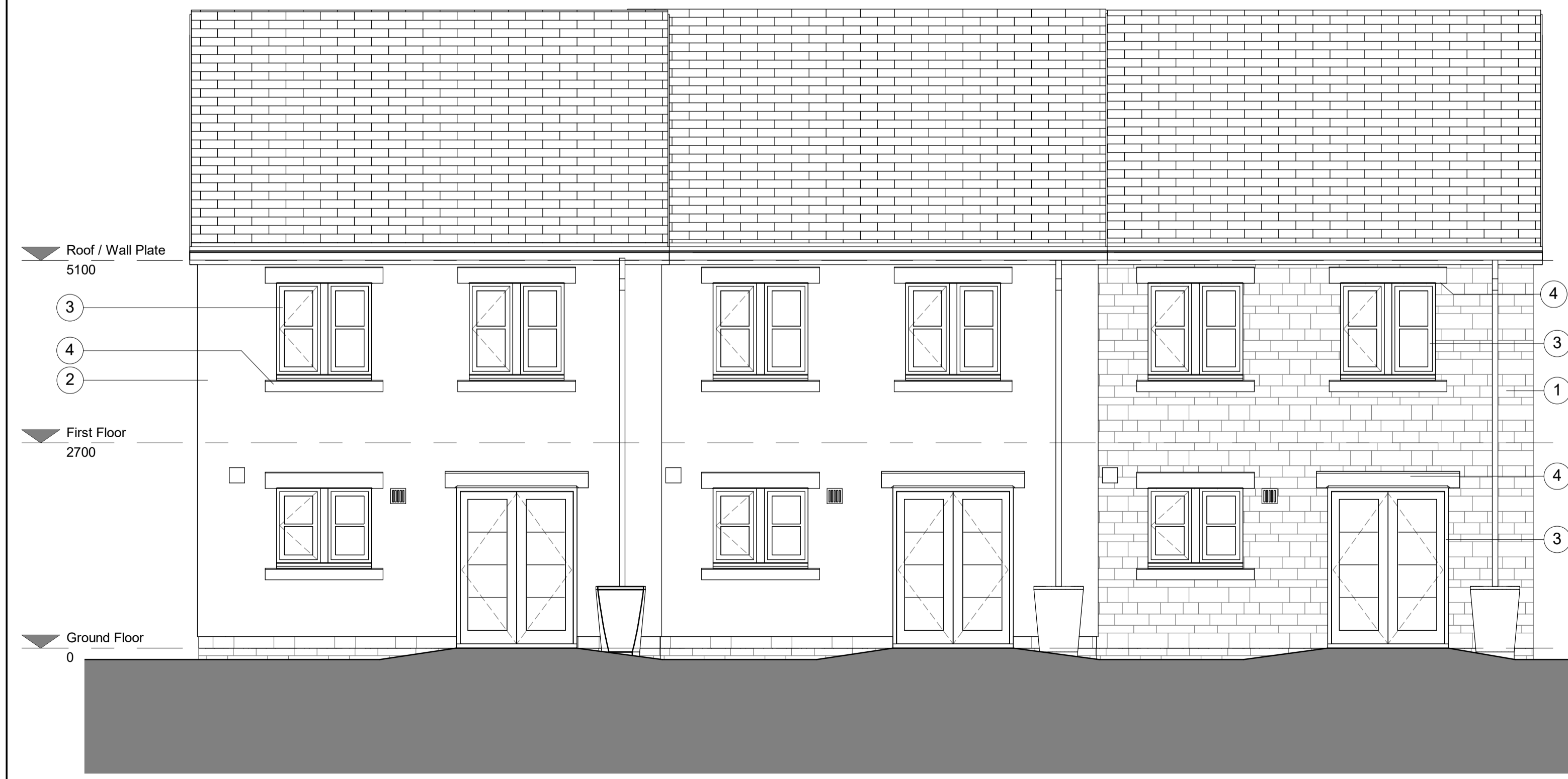
2 General Elevation - Rear 1 : 50