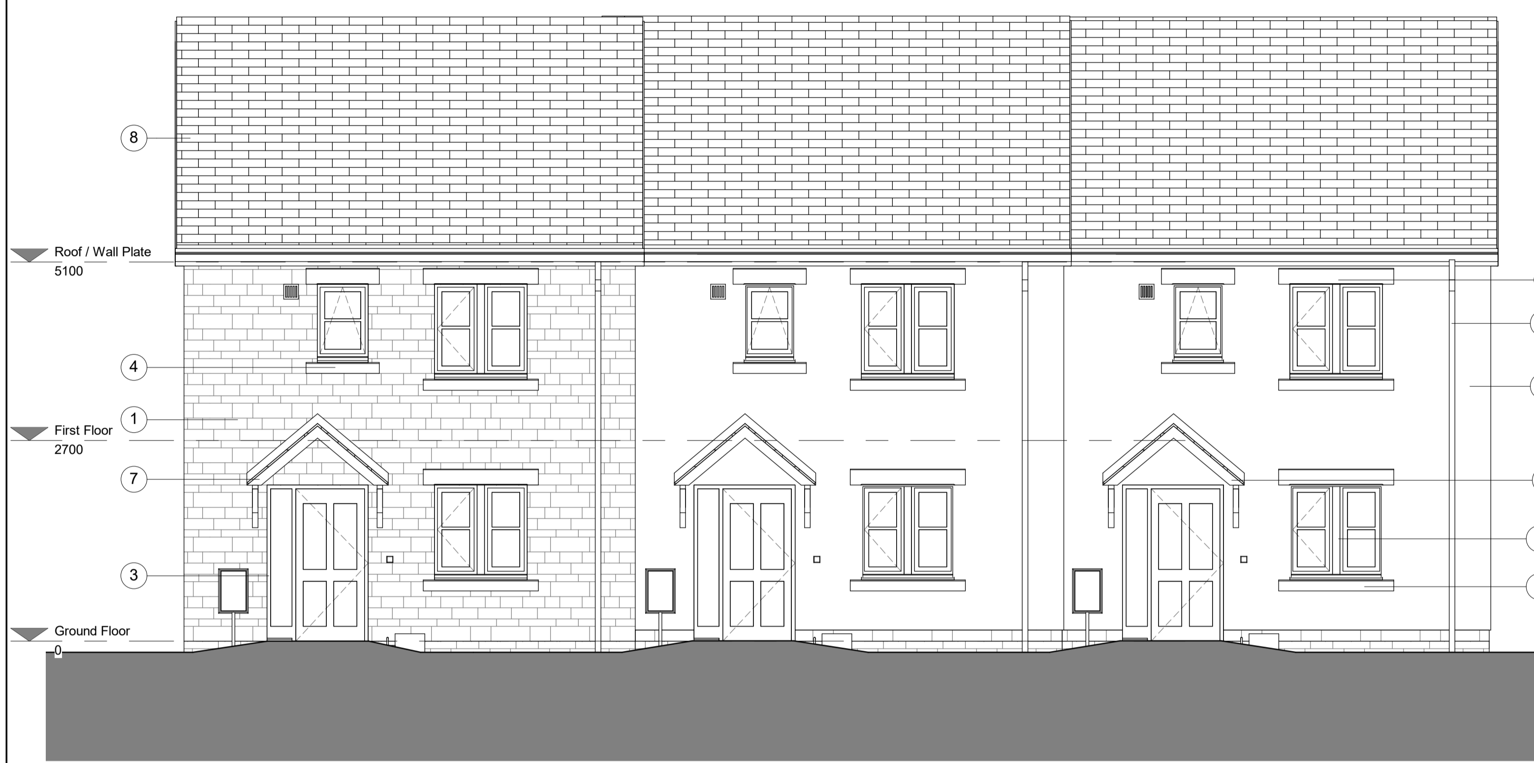
1 General Elevation - Front 1 : 50

General Notes 1. Contractor to verify all dimensions and check level datums on site 2. All of the designs are the sole property of TACP Architects Ltd and may not be used without their written agreement 3. All prints, specifications and their copyright are the property of TACP Architects Ltd 4. Do not scale off drawings 5. All dimensions shall be checked on site before commencement of shop drawings, manufacture and all discrepancies must be reported to TACP Architects Ltd