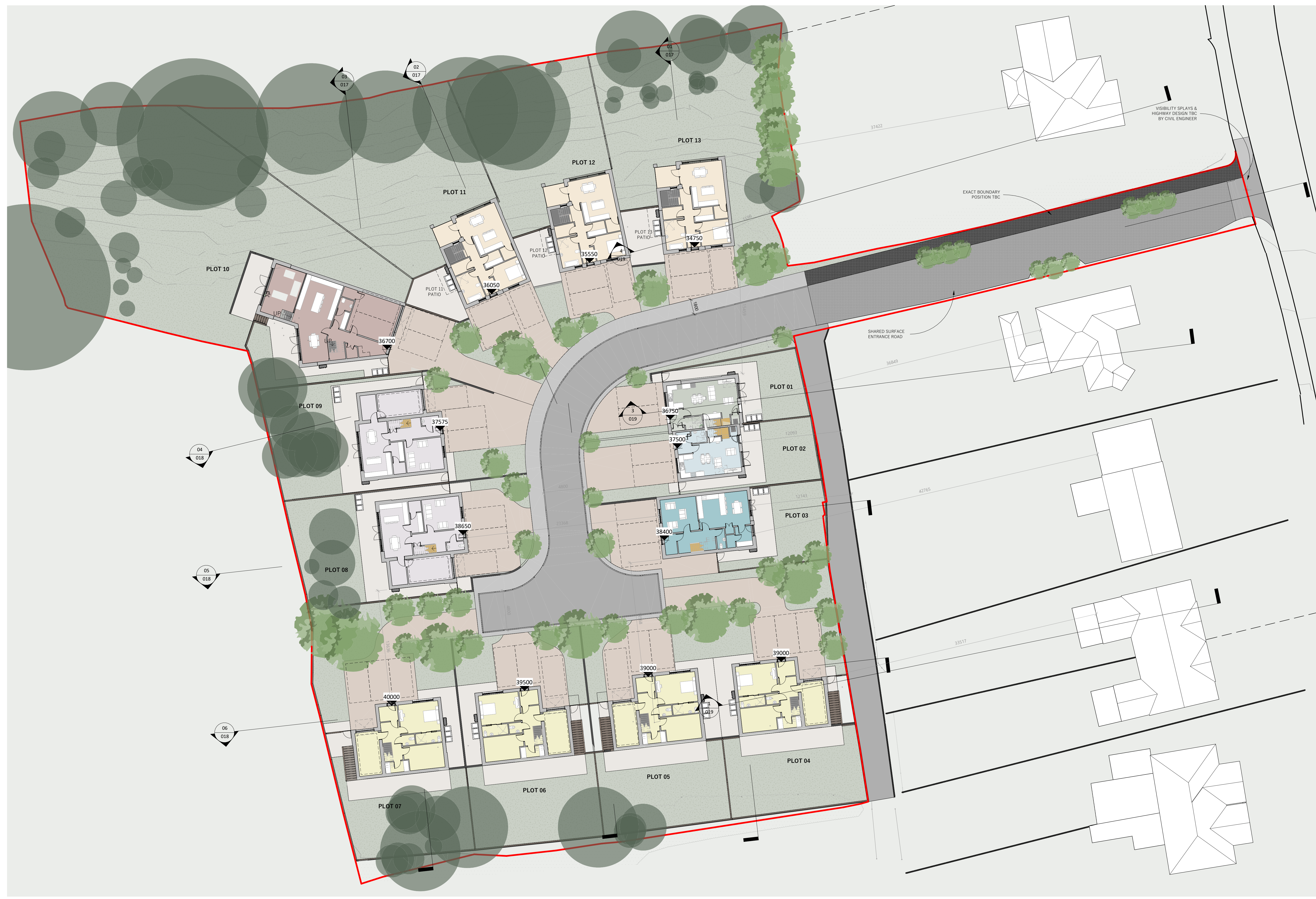
PROPOSED SITE PLAN SCALE: 1:200