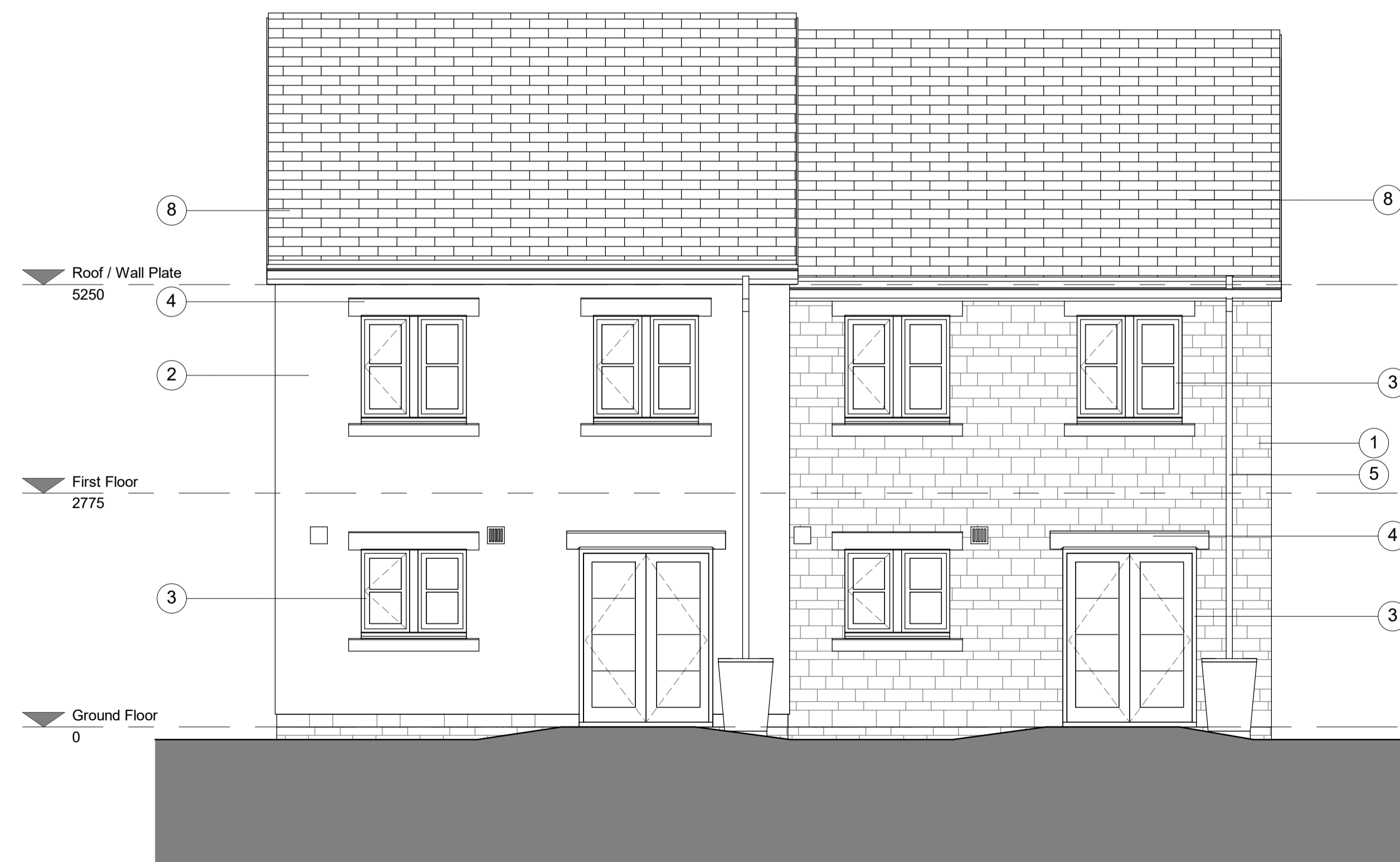
2 General Elevation - Rear 1 : 50