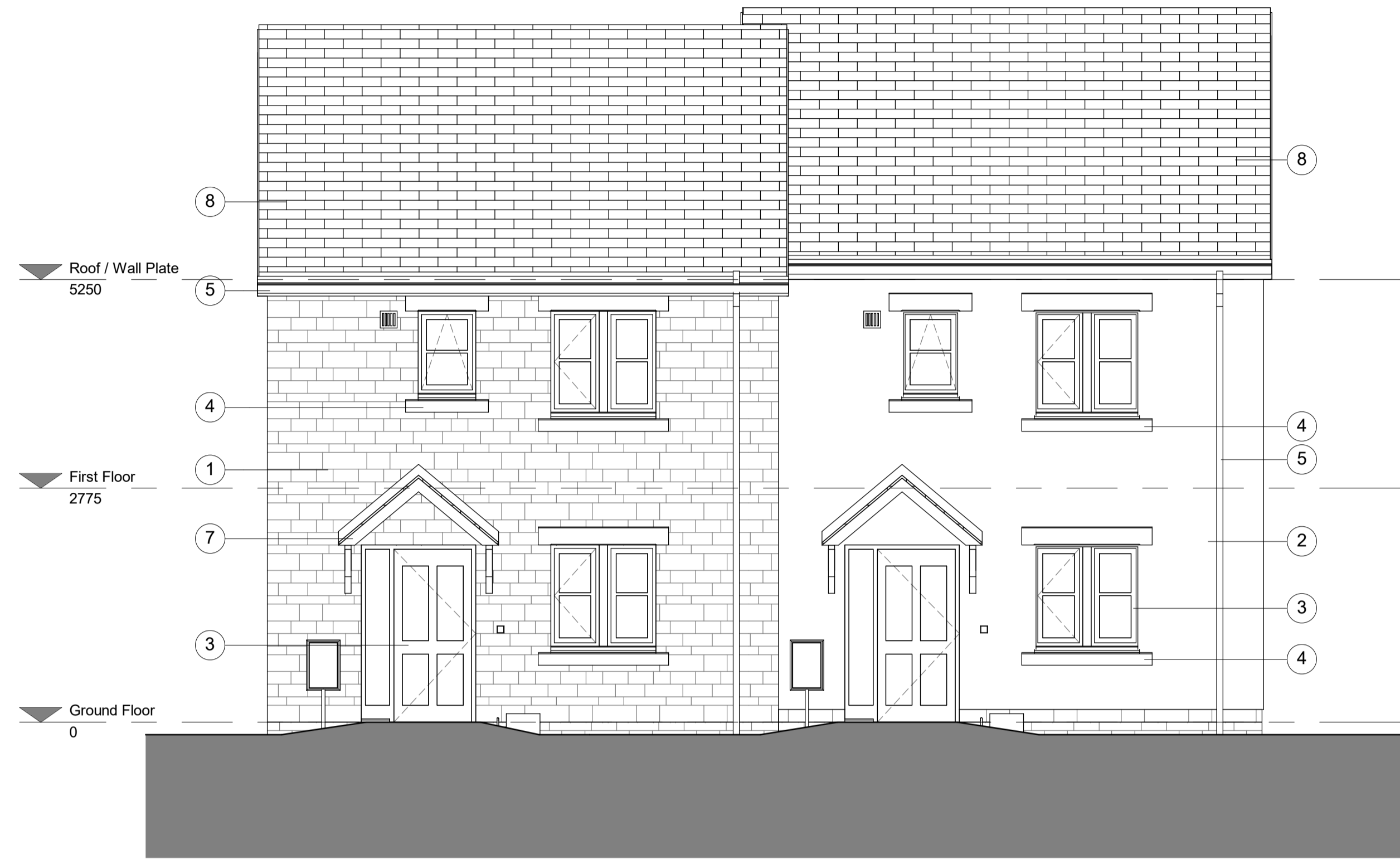
1 General Elevation - Front 1 : 50