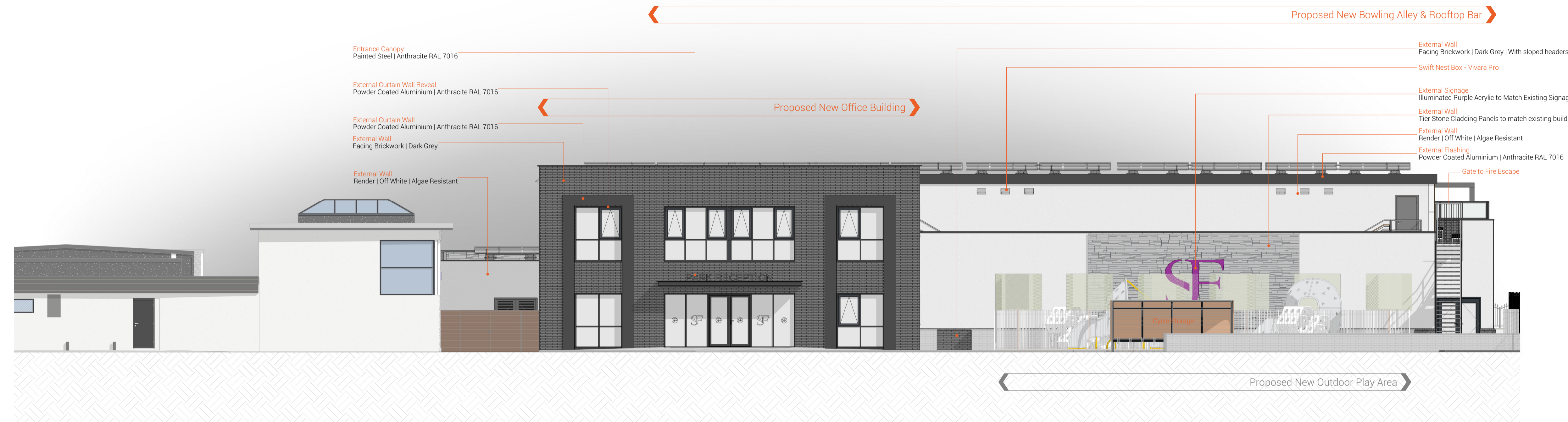
1 GA_Elevation_North Scale: 1:100

This drawing is copyright and to be returned to the architect on completion of the contract.