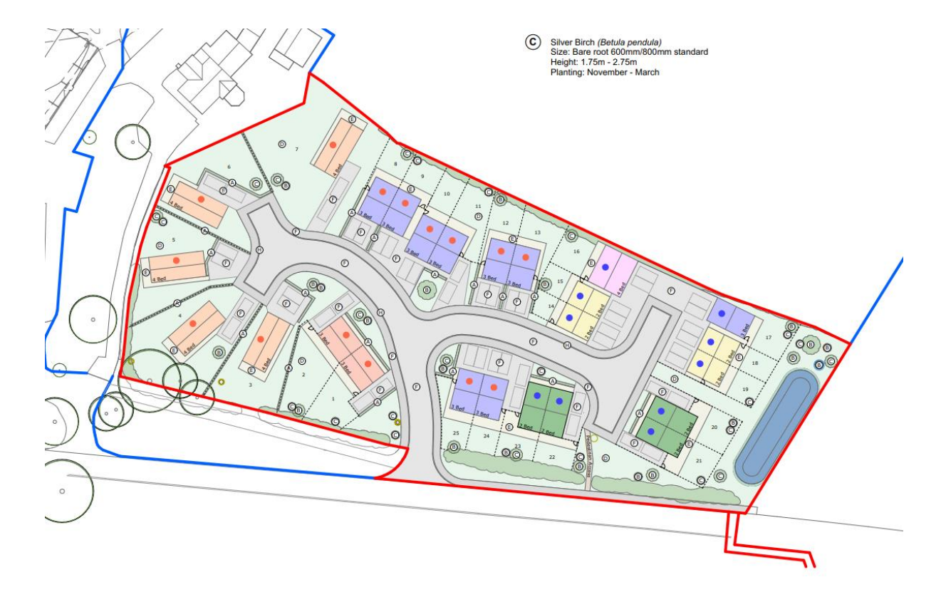
Figure 3.1 Extract of proposed site layout plan

3.6 The layout of the site comprises of an access road centrally into the site from the B5109 which would then split to provide access to the western and eastern part of the site. Open market dwellings are proposed to be located to the west of the site, with local market housing to be generally to be provided to the east. A surface water drainage basin would be located along the eastern site boundary.