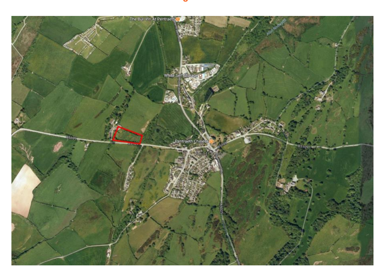
Figure 2.1 Aerial image identifying the application site in the context of its surroundings