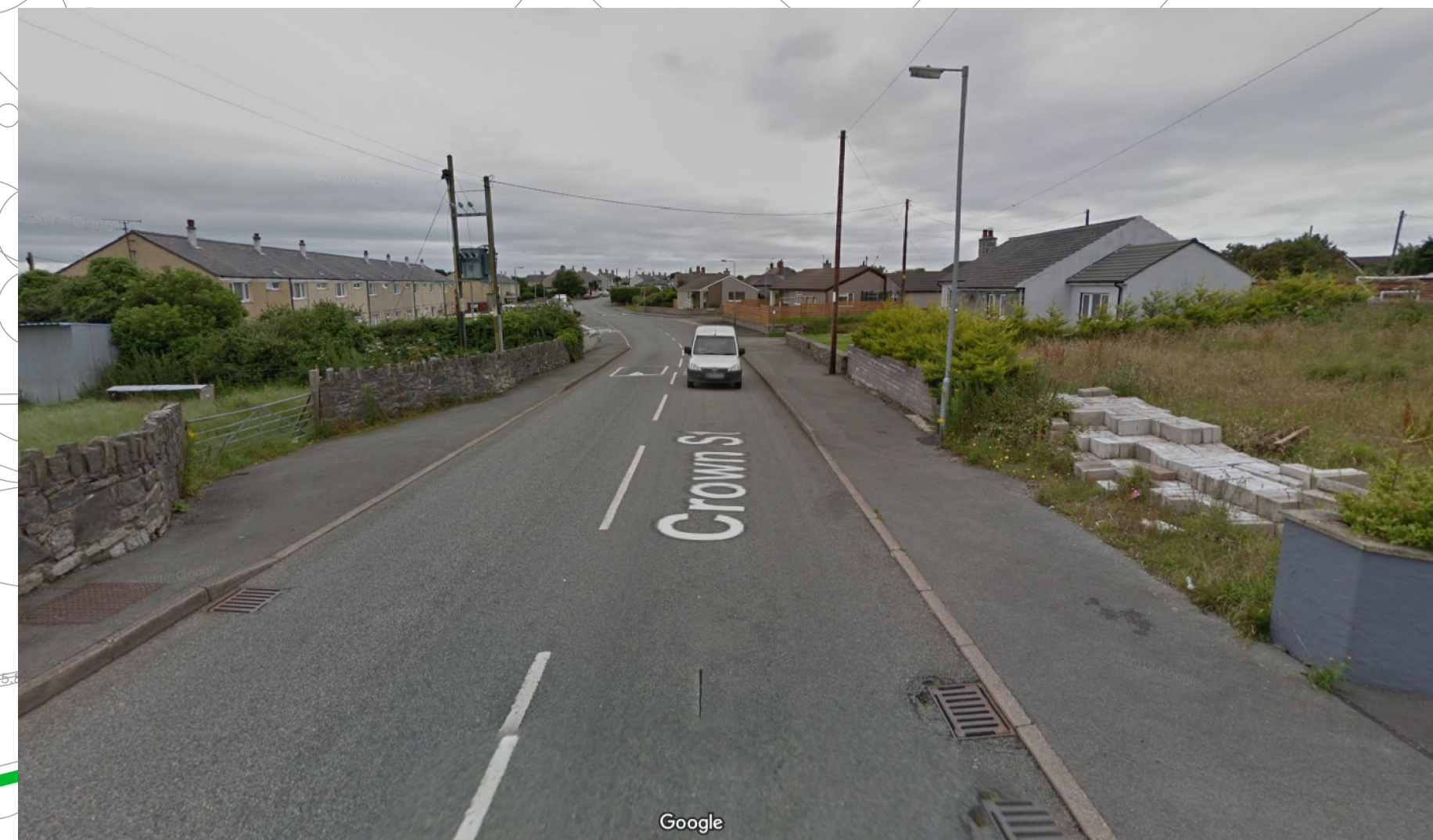
FIGURE 1. FROM ENTRANCE LOOKING SOUTH-WEST