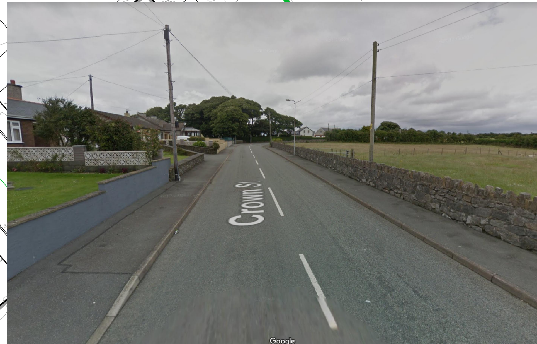
FIGURE 2. FROM ENTRANCE LOOKING NORTH-EAST