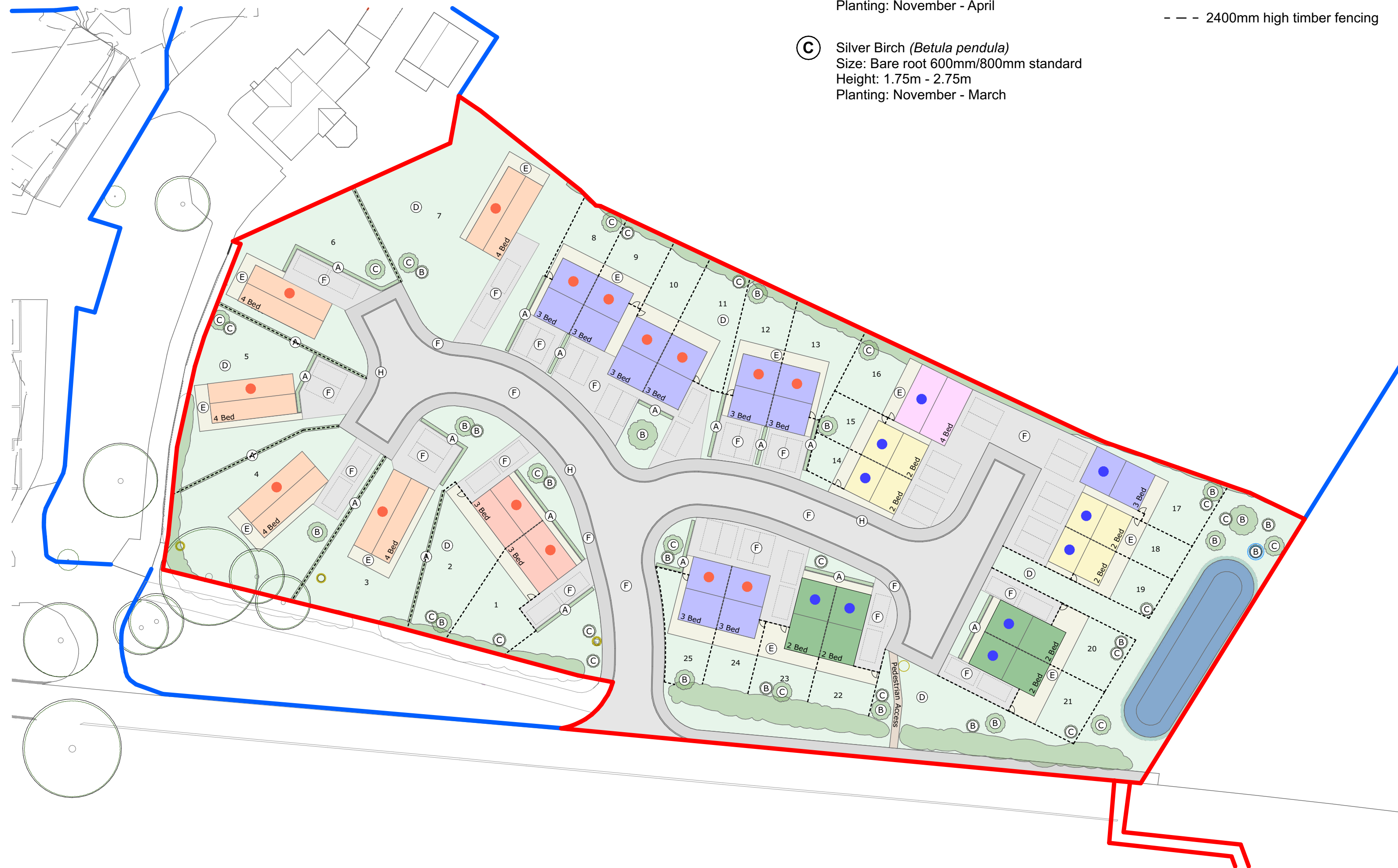
Proposed Landscaping Layout