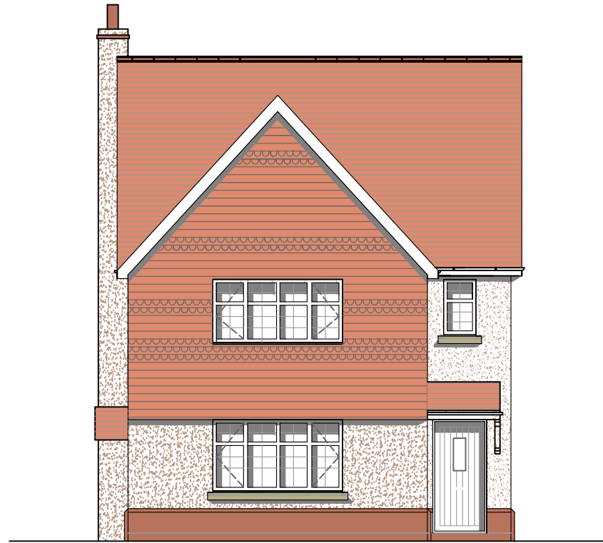
1 The Oakwood Front Elevation A 1:100