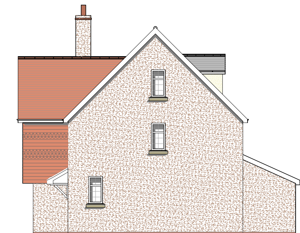
4 The Oakwood Side Elevation D 1:100