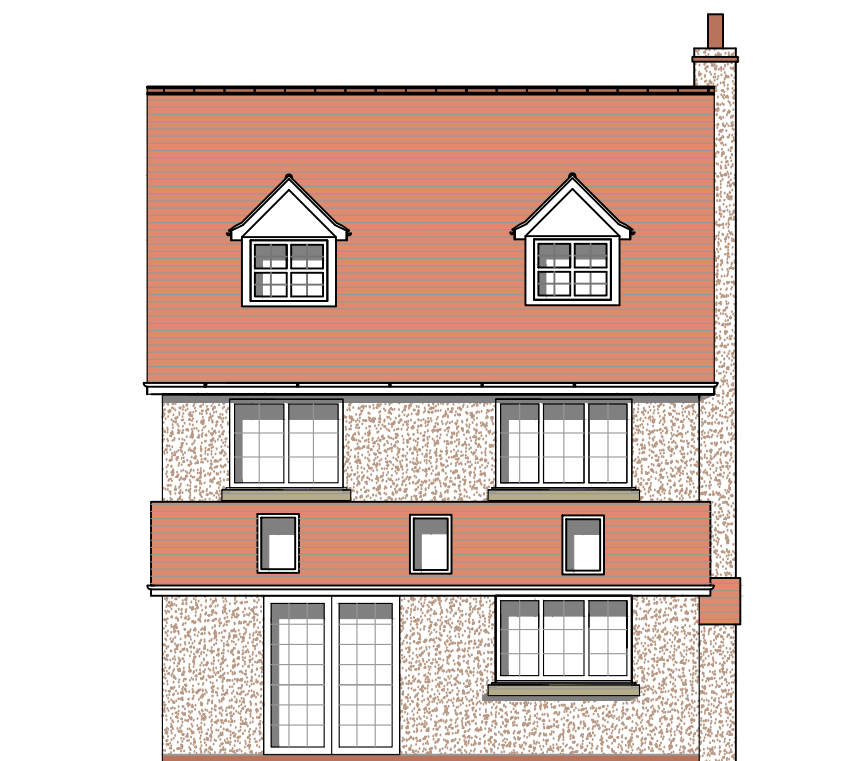
2 The Oakwood Rear Elevation B 1:100