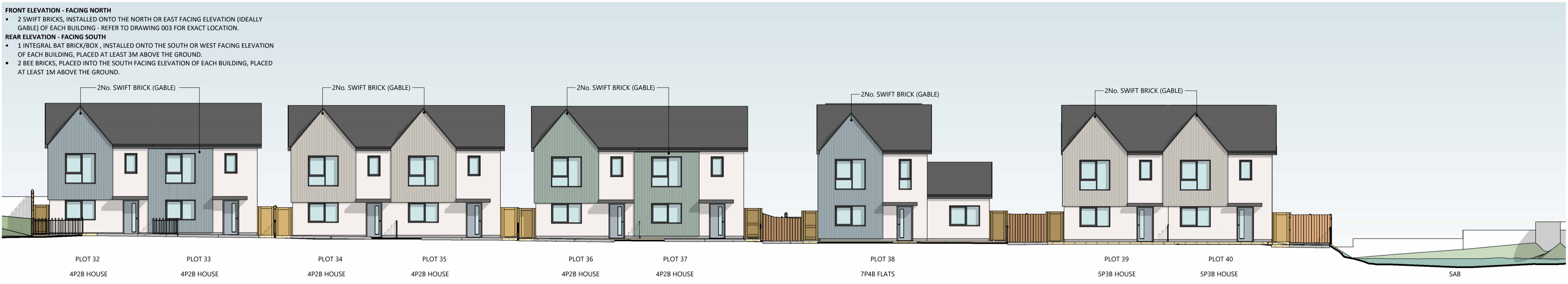
ELEVATION PLOTS 32-40