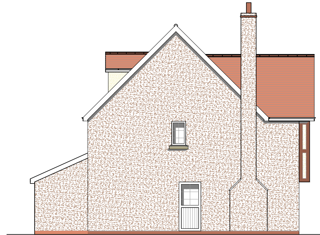
4 The Tudor Side Elevation D 1:100