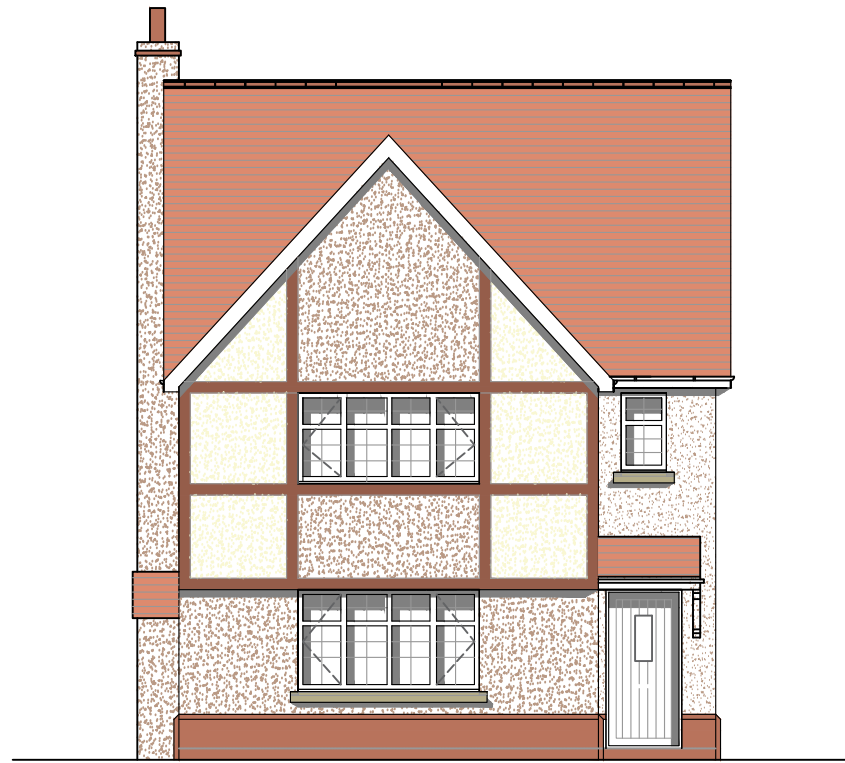
1 The Tudor Front Elevation A 1:100