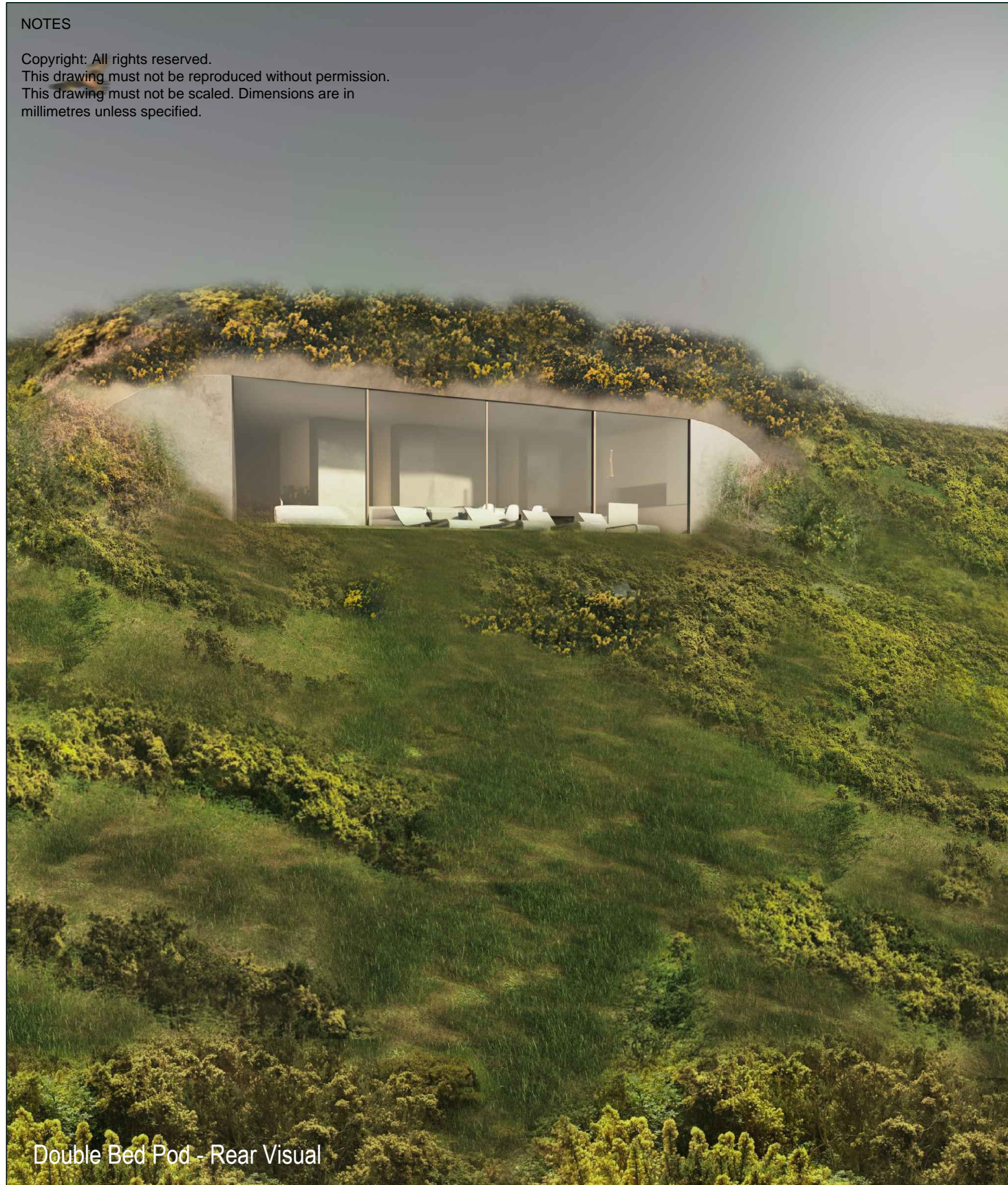
Double Bed Pod - Rear Visual

Copyright: All rights reserved. This drawing must not be reproduced without permission. This drawing must not be scaled. Dimensions are in millimetres unless specified.