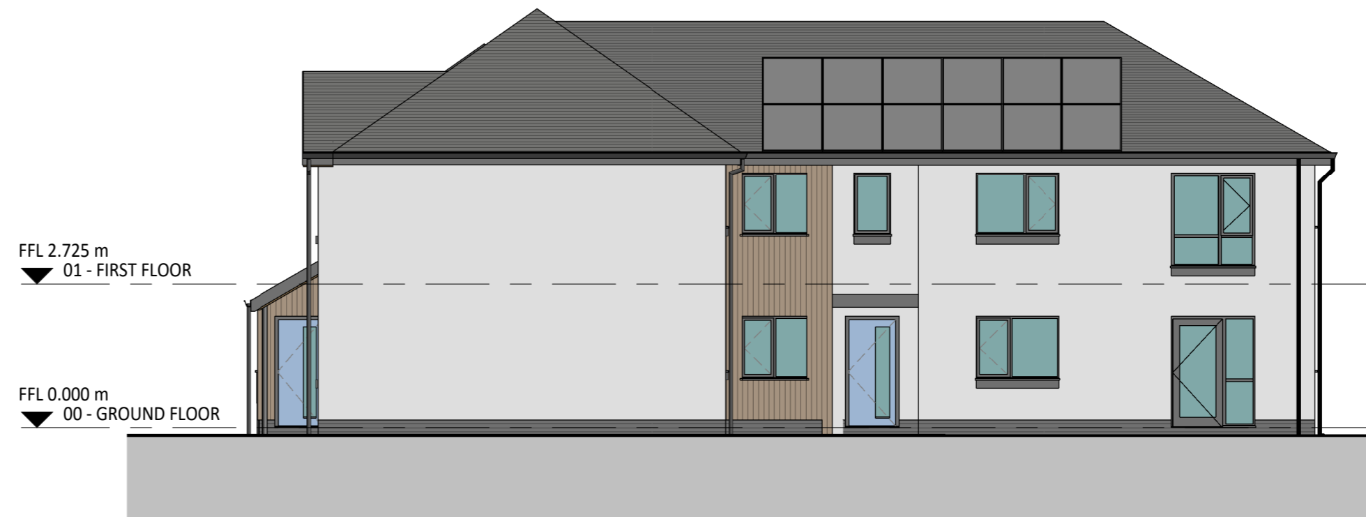
SIDE ELEVATION FACING SOUTH EAST