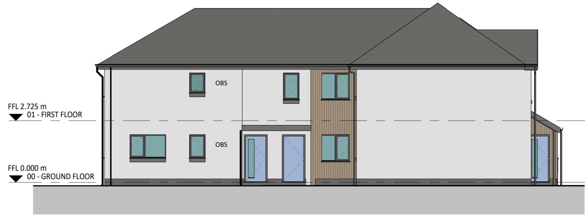
SIDE ELEVATION FACING NORTH WEST