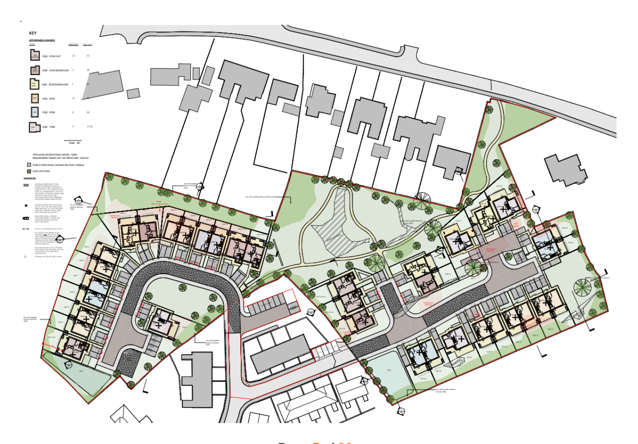
Page 5 of 39 Cadnant Planning Planning & Development Consultants | Ymgynghorwyr Cynllunio a Datblygu