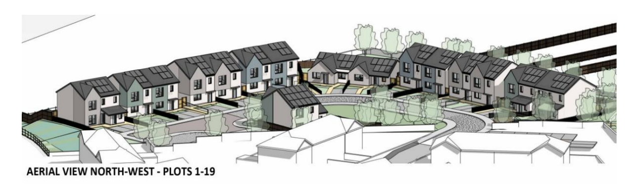
Figure 6.1 Illustration of proposed appearance of dwellings