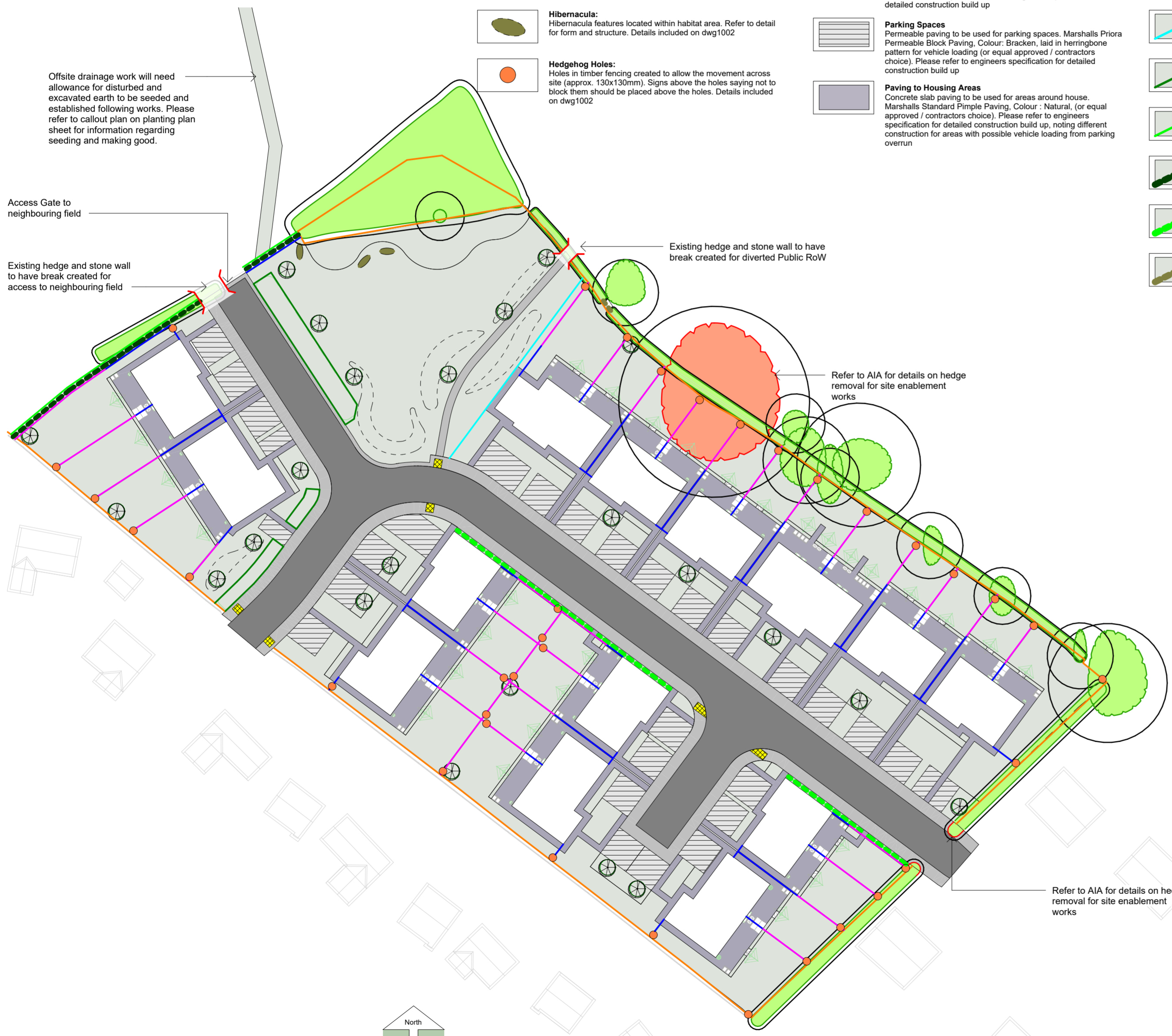
LANDSCAPE GENERAL ARRANGEMENT - 1:500