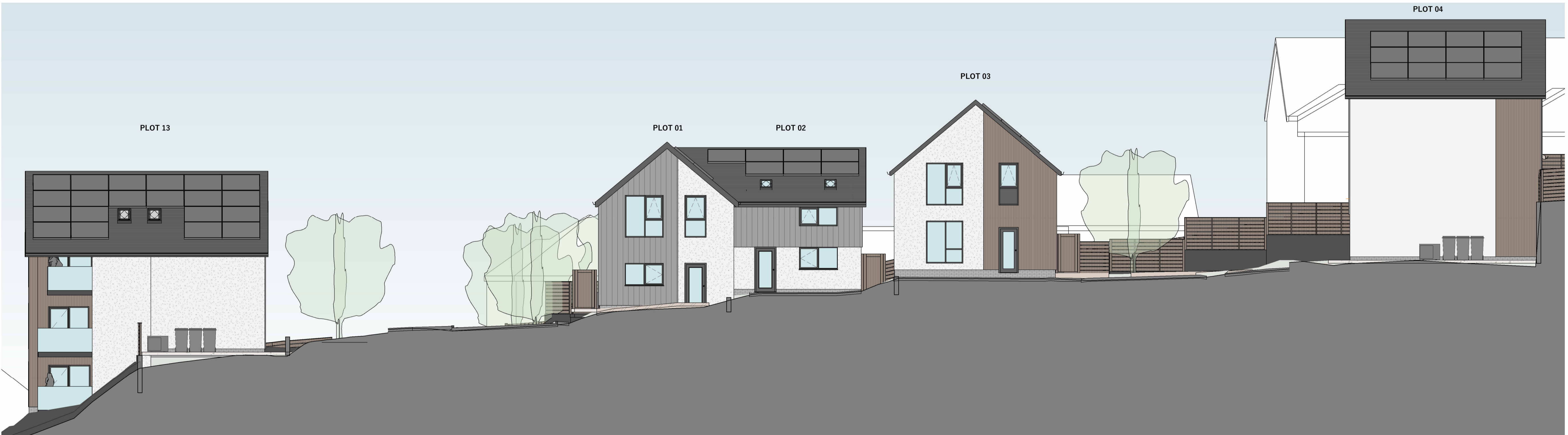
STREET ELEVATION 02 SCALE: 1 : 100