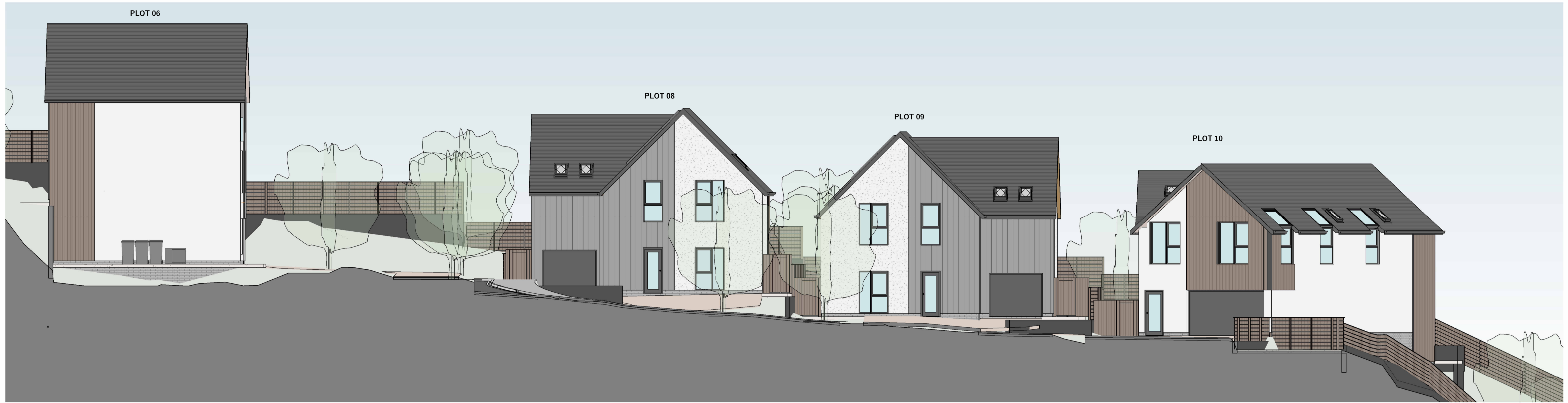
STREET ELEVATION 01 SCALE: 1 : 100